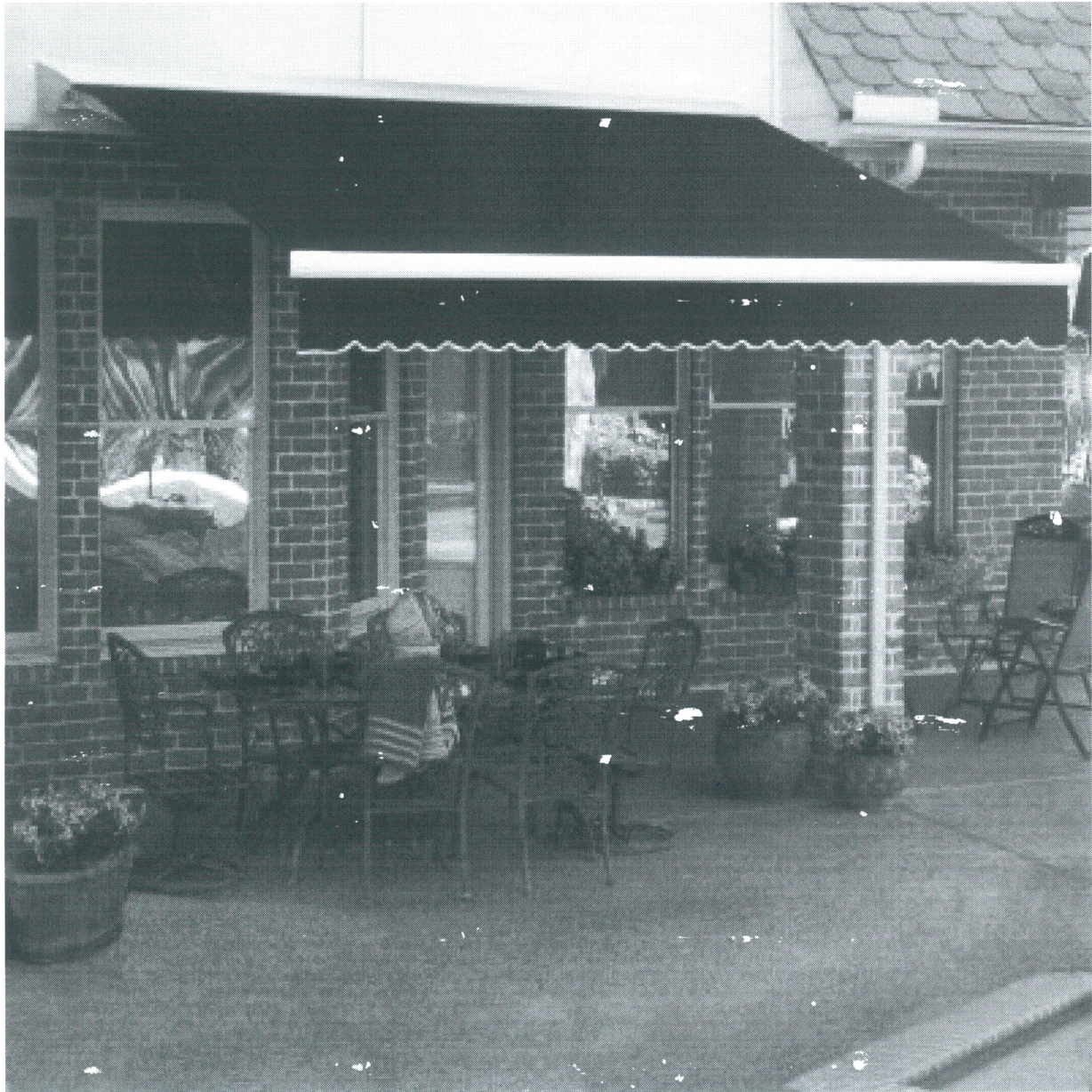
Sample of Projection and Look. Awnings are attached to the building and will be manually extended. Awnings are 15.5 wide and fully extended project 10' 3". They will be mounted on the left and the right of the entrance.